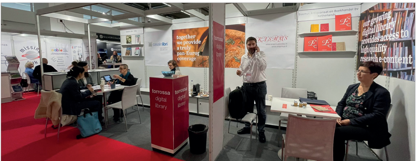
We were present at the Frankfurt Buchmesse in October, once again as joint exhibitors with Erasmus Boekhandel.

The 2024 Torrossa Retreat will take place on Thursday 18th April at the Teatro di Fiesole. More information can be found at www.torrossaretreat.org .