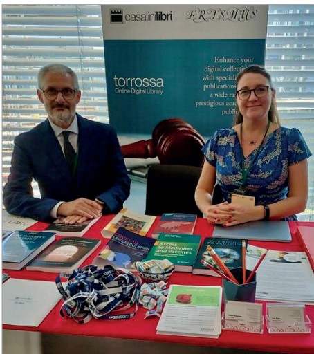
In attendance at the International Association of Law Libraries Annual Course in Geneva.

We continue in taking forward our mission to provide the best and widest possible access to scholarly content, with the continuing growth of our Torrossa Open collections of digital content in open access, and to support libraries and research institutions in the procurement and management of digital content with a focus on interoperability; we are currently working on the implementation of the COUNTER 5.1 standard and look forward to making it available to our customers soon.